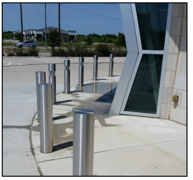
Sealed with EcoSeal Fortify to protect from rust and corrosion with an invisible Nano polymer metal oxide fusion which integrates with the Stainless Steel surface.