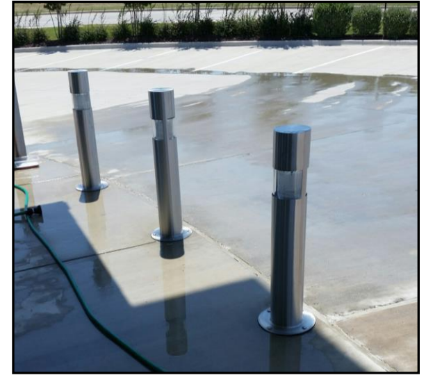
Center safety light posts (bollards) cleaned and drying to be sealed with EcoSeal Fortify to prevent re-rusting.